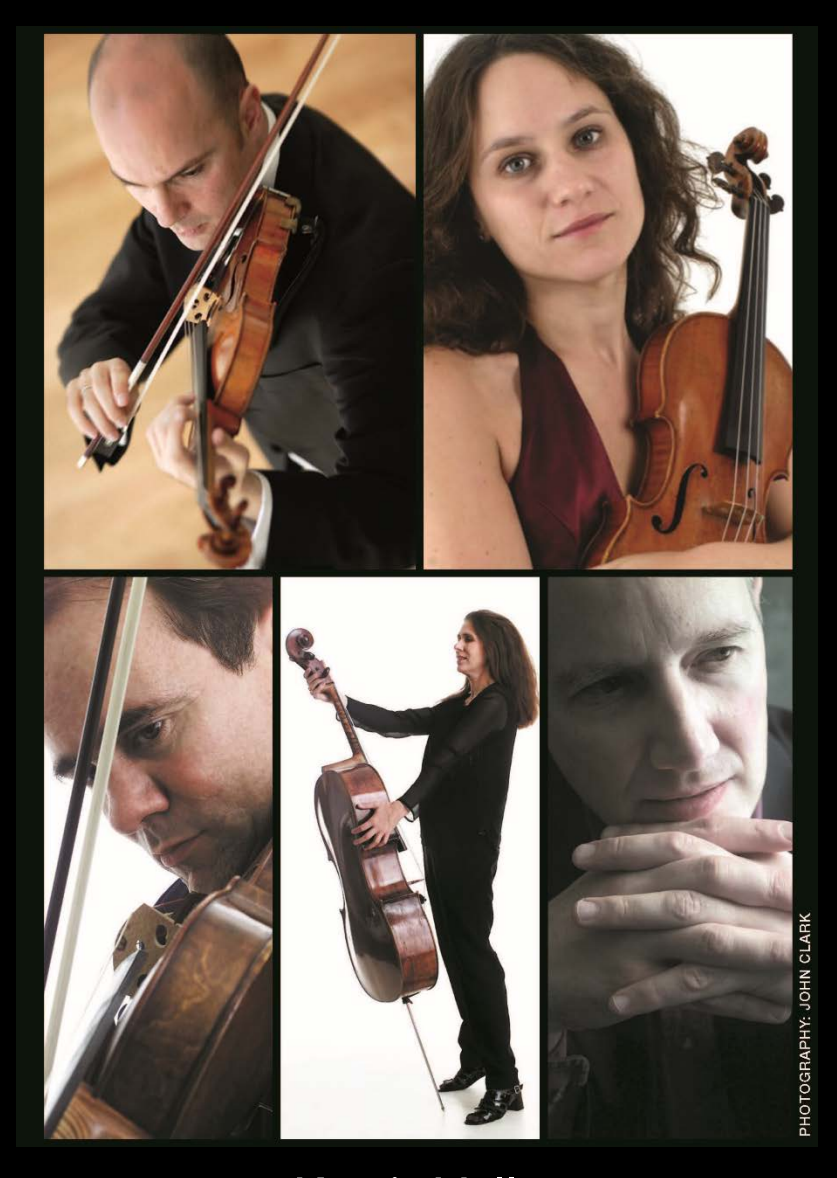
King's Hall Wednesday 14<sup>th</sup> March 2018